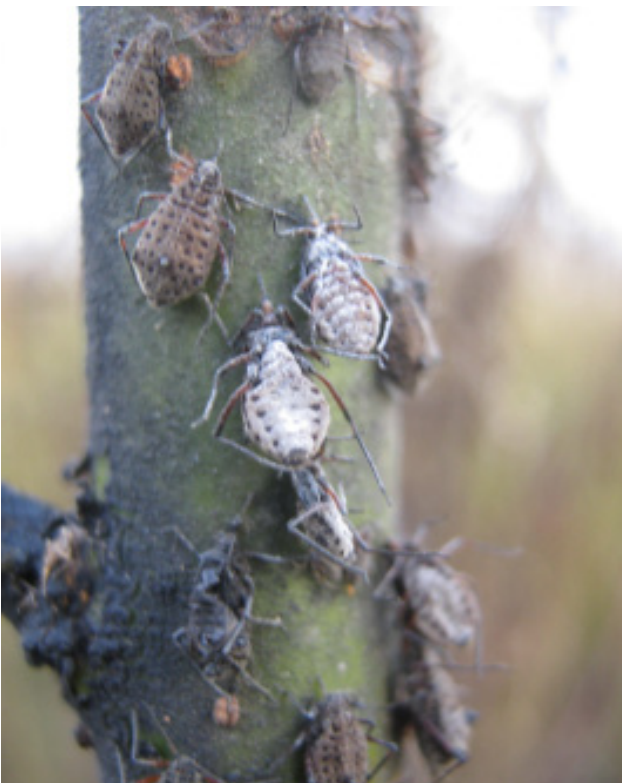
Figure 4. Giant willow aphids probably infected with Neozygites turbinatus (R.G. Kenneth) Remaud. & S. Keller.