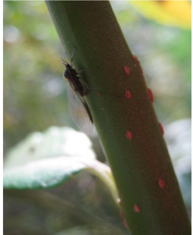
Figure 3. Winged giant willow aphid.