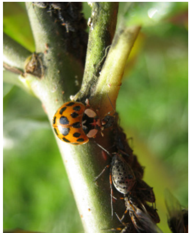
Figure 5. Harmonia axyridis (Pallas) ladybird feeding in giant willow aphid colony.