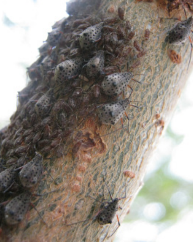
Figure 2. Giant willow aphids on willow shoot.